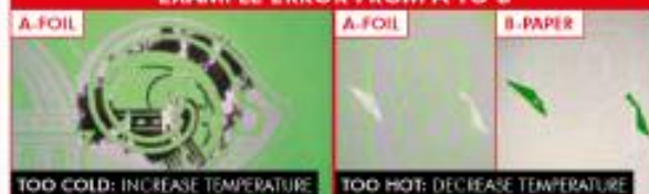
EXAMPLE ERROR FROM A TO B

IMPORTANT: Different printer manufacturers use different types of toner. The settings above are only reference values! Finding out the optimal temperature and time requires trial and error.